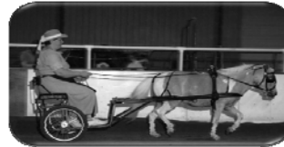
or just driving around the arena. Everyone love to watch and ride.

We will have some wagons on display and even giving rides to brave folks.